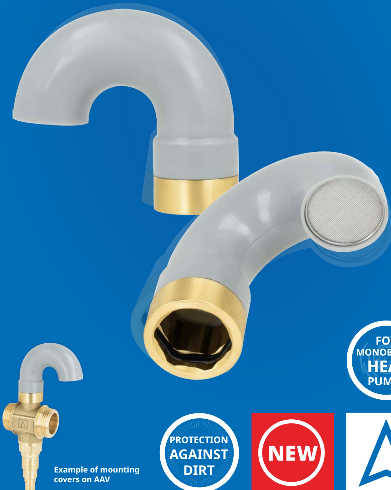
Example of mounting covers on AAV